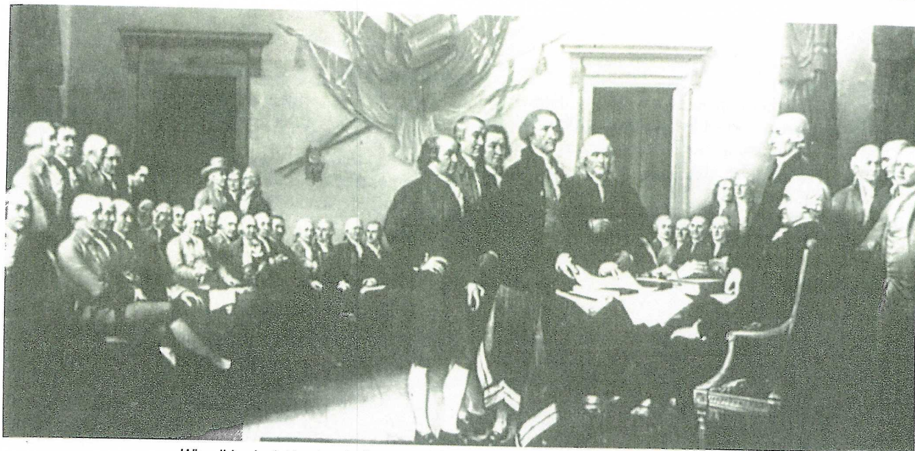
Why did colonial leaders believe a formal declaration of independence was needed?

Sovereignty in Britain rests in the British Parliament. Parliament can, as some have said, “do anything but make a man a woman.” It could, if it wished, repeal the English Bill of Rights or the remaining guarantees of Magna Carta, or in other ways change Britain’s unwritten constitution. Parliament would not likely use its sovereign power in such ways because of respect for the unwritten constitution by its members and by the British people as a whole.