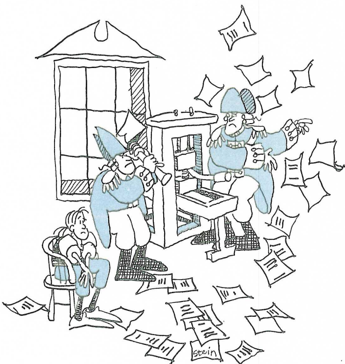
Should publishers be prohibited from printing criticisms of government leaders? Why? Why not?