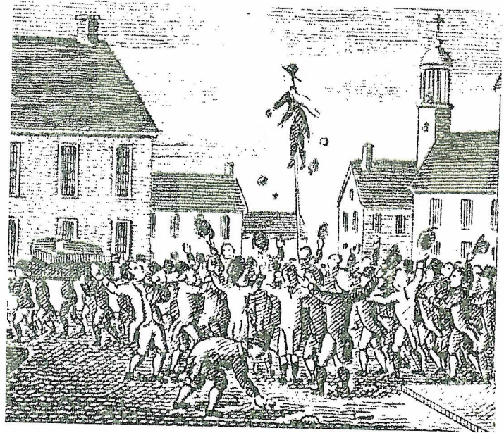
Why were the colonists angered by the Stamp Act of 1765?

Between the end of the war in 1763 and the Declaration of Independence in 1776, Britain tried to increase control of the colonies. To reduce tensions with the Native Americans, the British government passed a law forbidding the colonists from settling in the western territories. To raise revenue, the government increased control of trade and customs duties. The Stamp Act of 1765 introduced a new kind of tax on the colonists by imposing duties on stamps needed for official documents. To the British these measures seemed reasonable and moderate, but they had a common flaw. They lacked a fundamental principle of the natural rights philosophy—the consent of the governed.